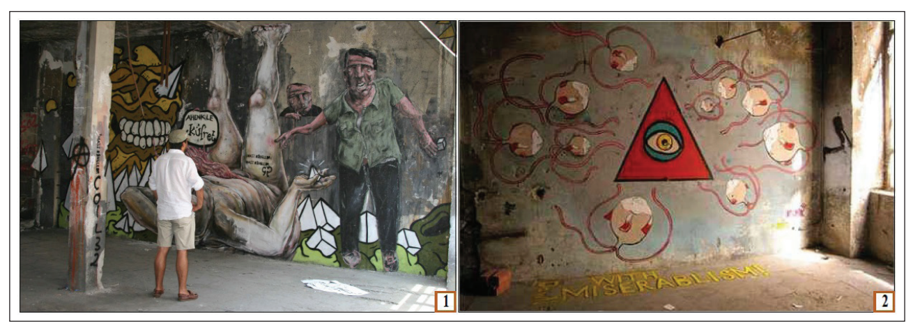
Figure 8. Banker Han (Banker Kastelli) interior use by graffiti and stencil artists 1-2 [36].

the Ottoman period, lost its vitality in its early stages and became out of use. In its derelict state, it was conquered by graffiti and stencil (spray paint) artists (Figure 8.). The relevant municipality (Beyoğlu Municipality) decided to transform the space into a gallery space by supporting the methods of graffiti and stencil artists to reproduce the space. With the support of Beyoğlu Municipality, Akçalı Boya, Koridor Contemporary Art, and StreetArt Istanbul, each floor of the seven-floor building was turned into an