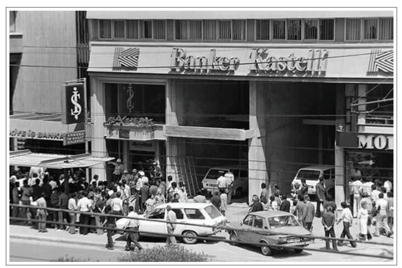
Figure 7. The first use of Banker Han (Banker Kastelli) [37].