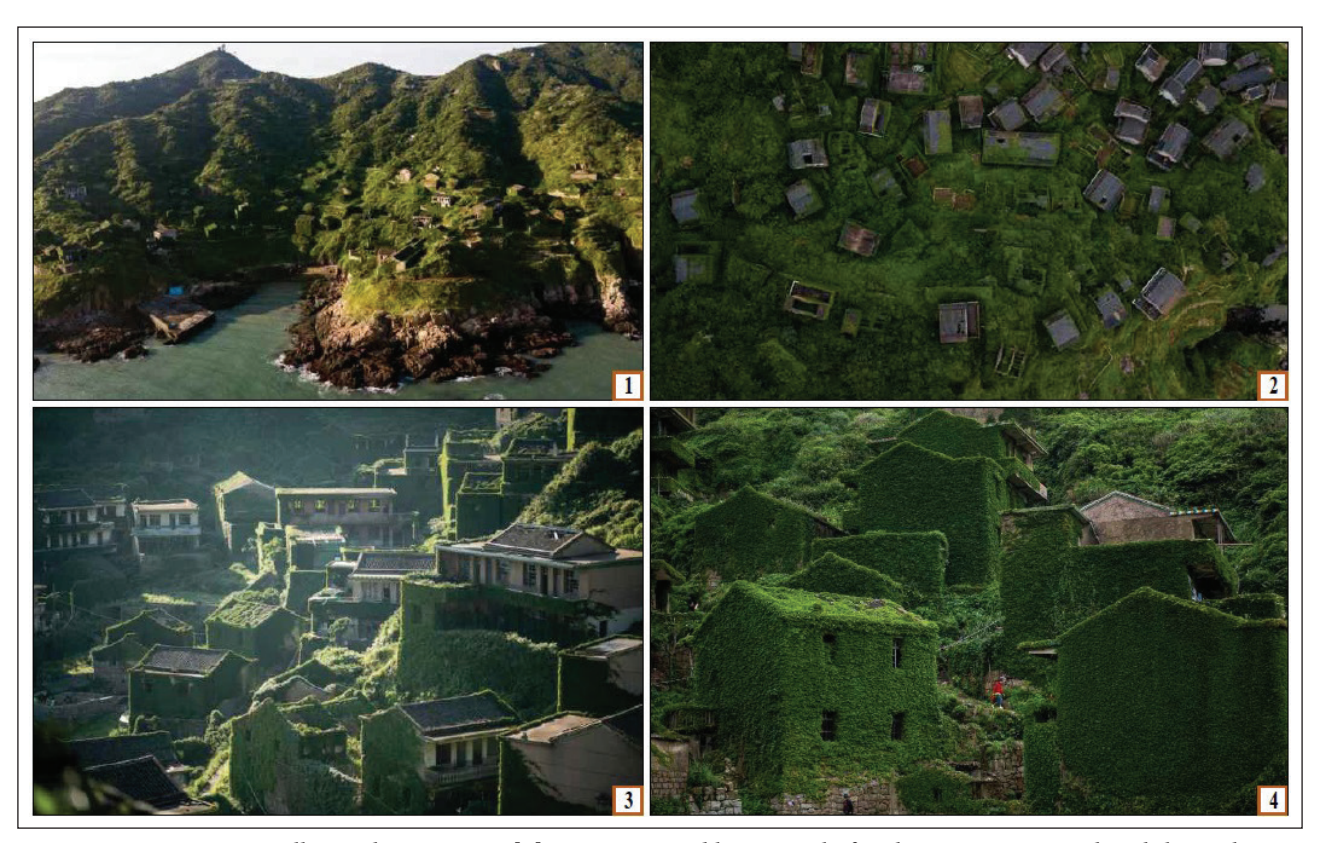
Figure 12. Houtouwan Village, China 1-2-3-4 [9] was conquered by nature before human actions such as hiking photography.

The industrialization process has deepened and clarified the detachment from nature. However, to understand the beginning of the rupture and the subject-object relationship, which has an active role in the process that evolves into the systematic consumption of nature, the research has found it appropriate to start with Modernity, which has an