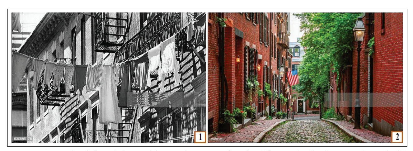
Figure 4. The social and physical change of the city of Boston North End read from its facades; the image of everyday life overflowing the streets was replaced by landscape elements 1-2 [28].

reasons of deterioration from the inside and outside by leaving them out of use (Figure 4).