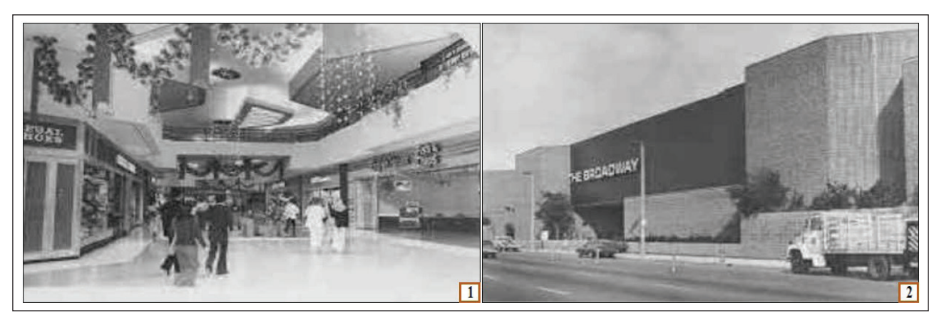
Figure 5. Interior and exterior images of the first use of Hawthorne Plaza Mall 1-2 [34].