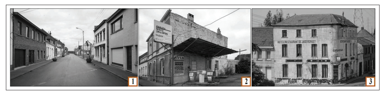
Figure 9. Images of the period when Doel Village began to be abandoned 1-2-3 [38].